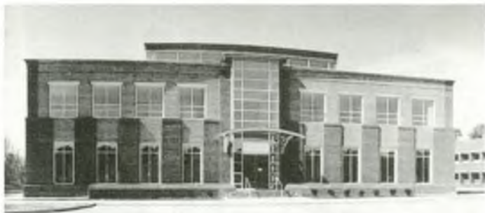
One of the buildings at the new Bruton Heights School Education Center in Colonial Williamsburg, Virginia.

of Regents at the University System of Georgia (USG) to provide detailed collection analysis and other database services to 34 state academic libraries in Georgia. The project is being directed by the Regents Academic Committee on Libraries of USG and is being performed in conjunction with the highly successful GALILEO (Georgia Library Learning Online) initiative, which provides a wide variety of information resources to the citizens of Georgia. Results from the assessment will be used in creating cooperative collection development policies and procedures for the academic libraries within the University System. The multipart project is scheduled for completion by the end of this spring.