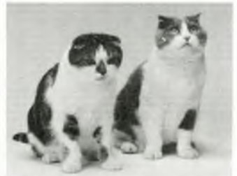
The Baker & Taylor mascots.

Baker & Taylor is accepting nominations for its 1997 Cat Contest from library employees and volunteers. The three categories of the contest are: Baker & Taylor look-alikes, best dressed cat, and most playful cat. To enter, cat owners must fill out an entry form and mail it along with a photo of their cat to Baker & Taylor by June 6, 1997. Photos of the 12 finalists will appear in