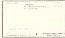
Temporary Shelf List