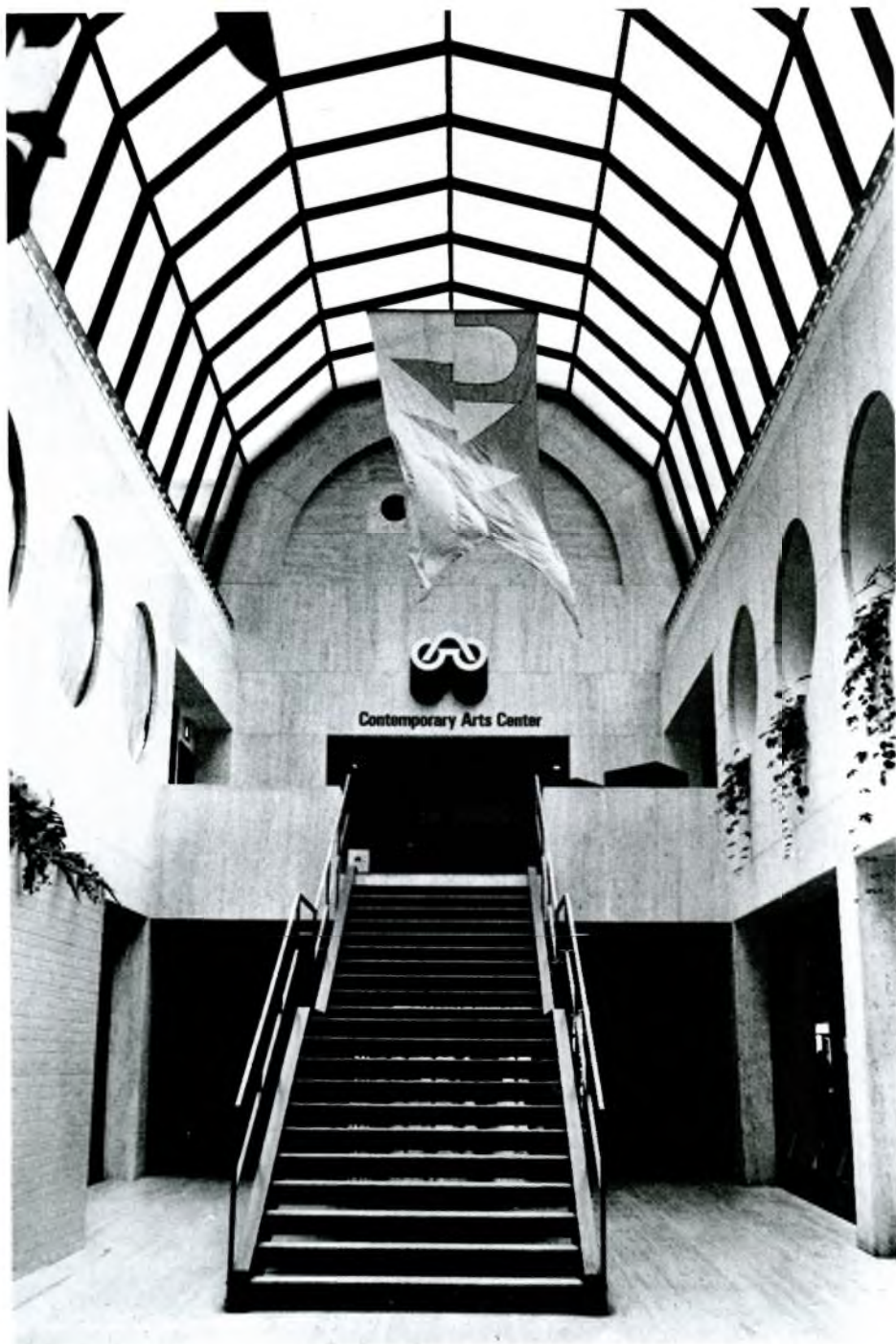
The Cincinnati Contemporary Arts Center presents continually changing exhibitions of recent art—from paintings, sculpture, photography, and architecture to multi-media installation, experimental, conceptual and video art, plus tours, concerts, films.