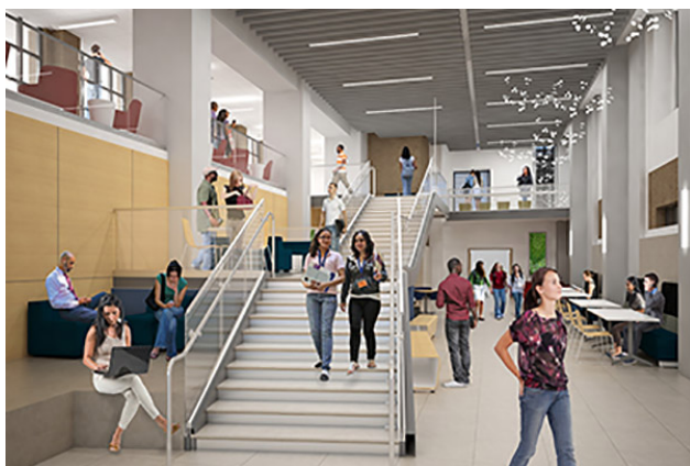
Rendering of the Pattee Library central atrium addition.

The U.S. Government Publishing Office (GPO) named the University of Mississippi's J. D. Williams Library as the 2018 Federal Depository Library of the Year. The library was selected for its creative